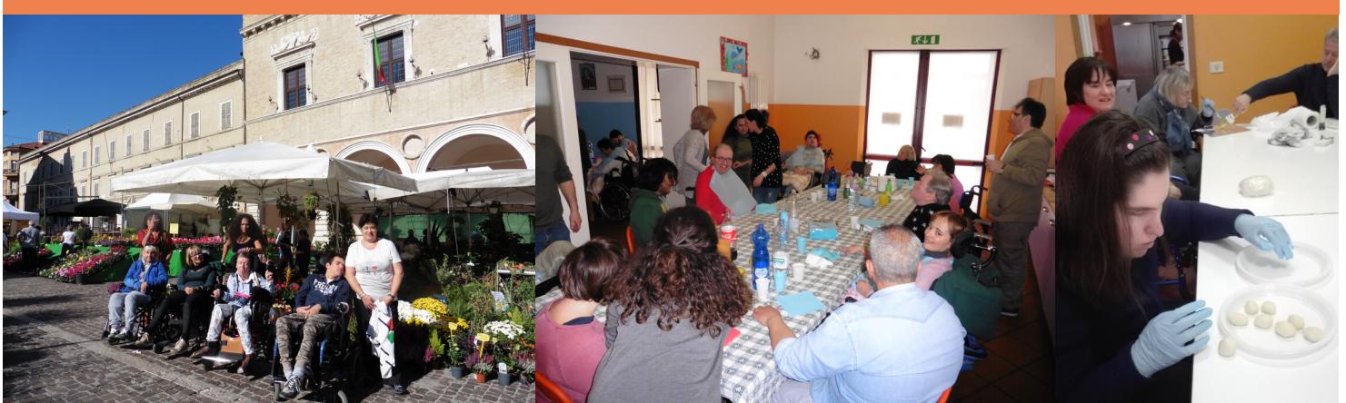
Trips around Pesaro